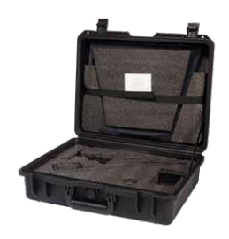
HC-600 Hard Case for TP-600/650 Teleprompter Kit