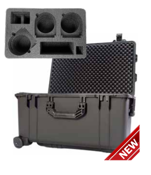
HC-800FS Water, Dust and Crush Resistant Case with foam compatible with PTC-280, PTC-140T and PTC-150TL - Trolley Style (XXL)