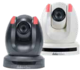
PTC-150 1080P Camera