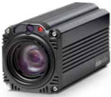
BC-80 1080P Camera