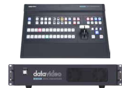
SE-2850 8 to 12 Input 1080p60 Switcher