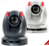
PTC-300 4K Camera