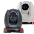
PTC-140T 1080P HDBaseT Camera