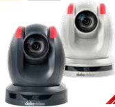
PTC-285 4K Tracking Camera