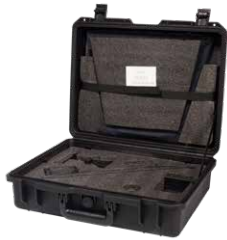
HC-600 Hard Case for TP-600/650 Teleprompter Kit