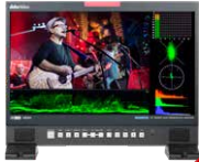
TLM-170K/KM/KR 17" ScopeView Production Monitor