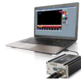
CG-250 HD/SD Character Generator