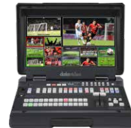
HS-3200 12 Input HD Mobile Studio