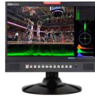
TLM-170V/VM/VR 17" ScopeView Monitor