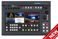
SHOWCAST 100 4K ShowCast Studio