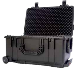
HC-700 Water, Dust and Crush Resistant Case - Trolley Style (XL)