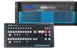
TVS-1000A 2D 1 Input HDMI Trackless