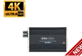
HBT-16 HDBaseT Receiver Box