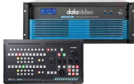
TVS-3000 4K AR 3D Tracking & Trackless