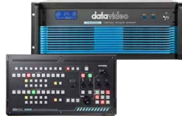
TVS-2000A 3D 2 Input 3G-SDI Tracking & Trackless