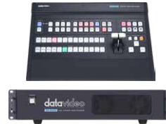
SE-3200 12 Input 1080p60 Switcher