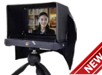
TTL-100 Through the Lens Kit