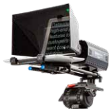
TP-500 DSLR Prompter