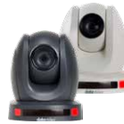
PTC-140 1080P Camera