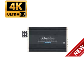
HBT-15 HDBaseT Transmitter Box