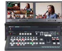
GO 1200 Studio 6 Input HD Studio