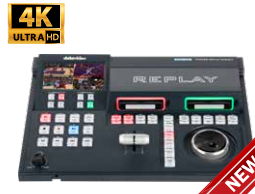
RPL-100 Prores Replay System