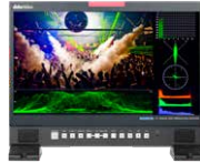
TLM-170F/FM/FR 17" ScopeView Production Monitor