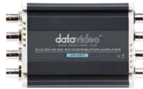
VP-597 2x6 3G-SDI Splitter