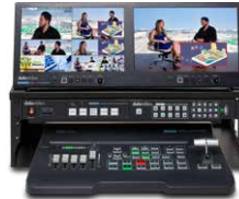
GO 650 Studio 4 Input HD Studio