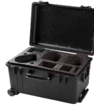
HC-800 Water, Dust and Crush Resistant Case - Trolley Style (XXL)