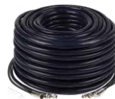
CB-24 SD 100m 3-in-1 Cable (SDI/ITC/CVBS)