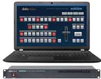
SE-1200MU 6 Input HD Switcher