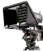
TP-300 Tablet Prompter