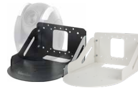
WM-1 Wall Mount for PTC Camera