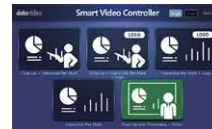
Control for VGB-2000/4000 Professional presentation system: