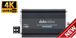
DAC-9P 4K 4K HDMI to SDI