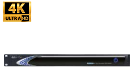
KMU-100 2 Input 4K Virtual Multicamera Processor