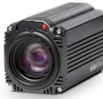
BC-50 1080P Camera with Streaming Encoder