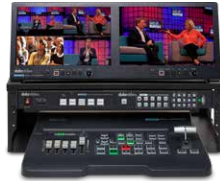
GO 500 Studio 4 Input Mixed Resolution Studio