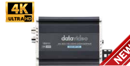
DAC-8P 4K 4K SDI to HDMI