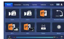
Control for iCAST 10NDI 5-Channel All-in-one Streaming Switcher :