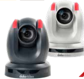
PTC-285T 4K HDBaseT Tracking Camera