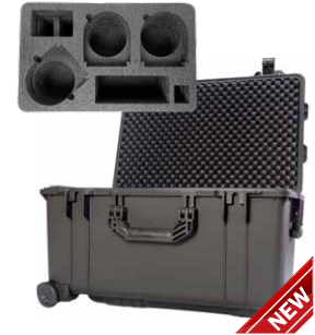
HC-800FS Water, Dust and Crush Resistant Case with foam compatible with PTC-280, PTC-140T and PTC-150TL - Trolley Style (XXL)