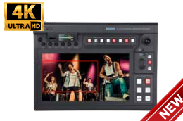
KMU-300 4K Multi-Channel Streaming Switcher