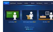
Control for DVK-400 4K Chromakey: