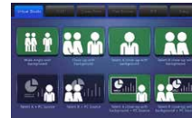
Control for OBV/MS/HS/SE-3200 Switcher: