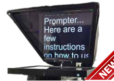
TP-700 ENG Teleprompter