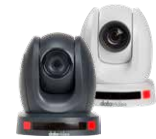
PTC-140NDI NDI PTZ Camera