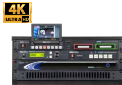
VGB-4000 4K Pro Presentation System