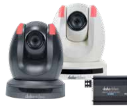
PTC-150T 1080P HDBaseT Camera