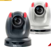
PTC-300NDI NDI 4K Camera