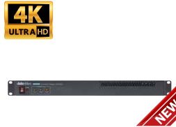
HBT-30 HDBaseT Receiver Box