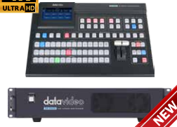
SE-4000 4K 8-Channel Digital Video Switcher