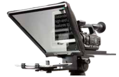
TP-650 Large Screen Prompter Kit for ENG Cameras