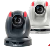
PTC-280NDI NDI 4K Camera