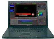
CG-500 HD/SD Graphic & Character Generator