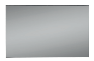
Ultra thin frame