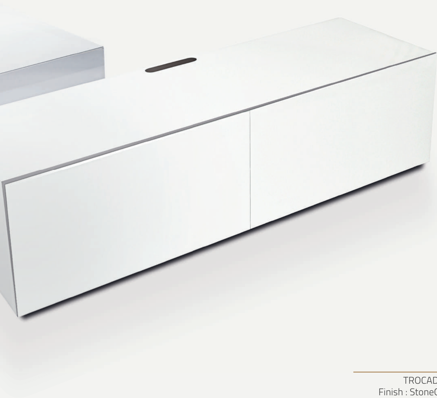
TROCADÉRO Finish : StoneGloss Colour : Blanc