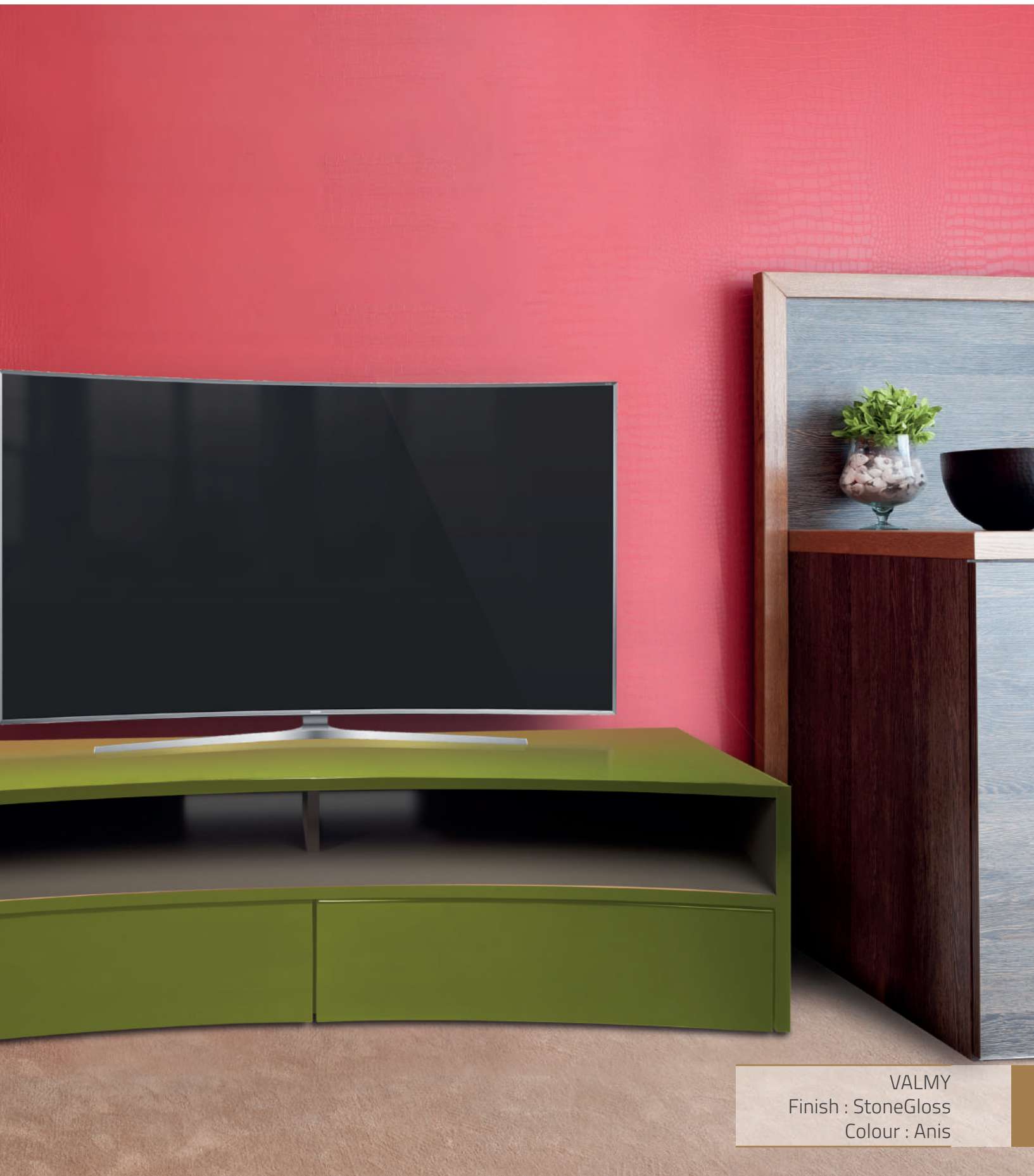
VALMY Finish : StoneGloss Colour : Anis