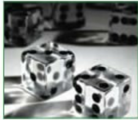
20,000:1 Contrast Ratio