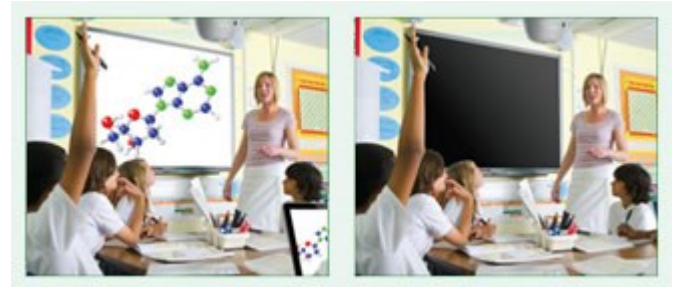
Eco AV mute off 100% power consumption

Stay in control of your presentation with Eco AV mute. Direct your audience's attention away from the screen by blanking the image when no longer needed. This also reduces the power consumption by up to 70%, further prolonging the life of your lamp.