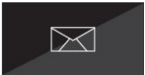
Email alerts and instant notifications - help desk requests, service reminders, device failure or theft