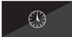
Track projector light source usage