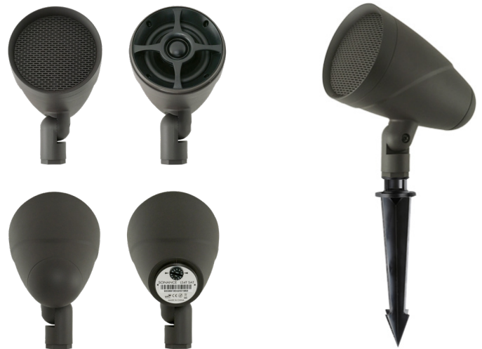
Ground stake sold separately