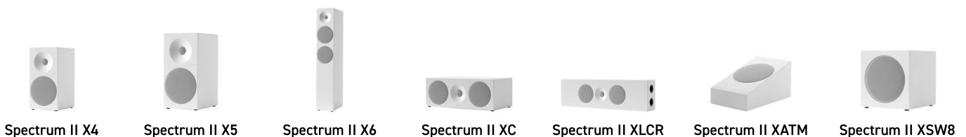
Spectrum II X4