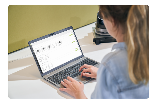
EASILY SWITCH BETWEEN SEVERAL ROOM LAYOUTS SERVING MULTIPURPOSE SPACES